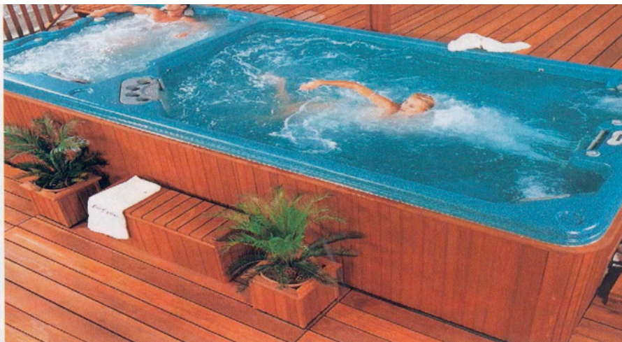
■ Like portable hot tubs, above-ground swim spas are constructed with a fiberglass or acrylic shell. The jetted Fitness Pro 4700 swim spa from Cal Spas, above , features separate sections for swimming and soaking.